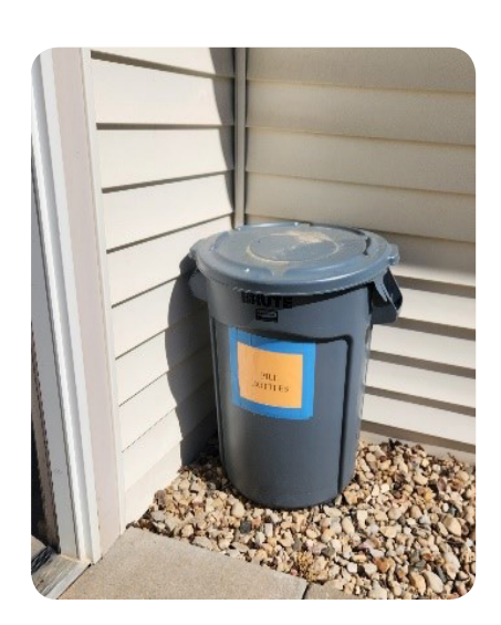
Bin for prescription pill bottles at Prairie Point