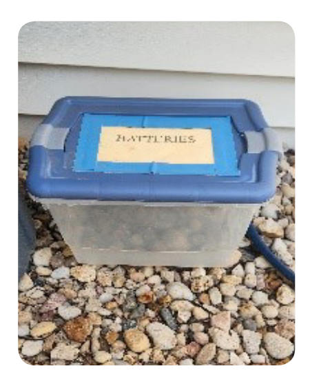
Box for batteries at Prairie Point

model home. Place these in the large gray garbage container inside the gate by the garage. Do you have papers that need to be shredded? Attic Angel Place has a large, locked bin in the library in which you can drop papers that Access Shredding Service will collect for shredding, and the shredded material will then be recycled. Please help our Attic Angel community by participating in these recycling opportunities!