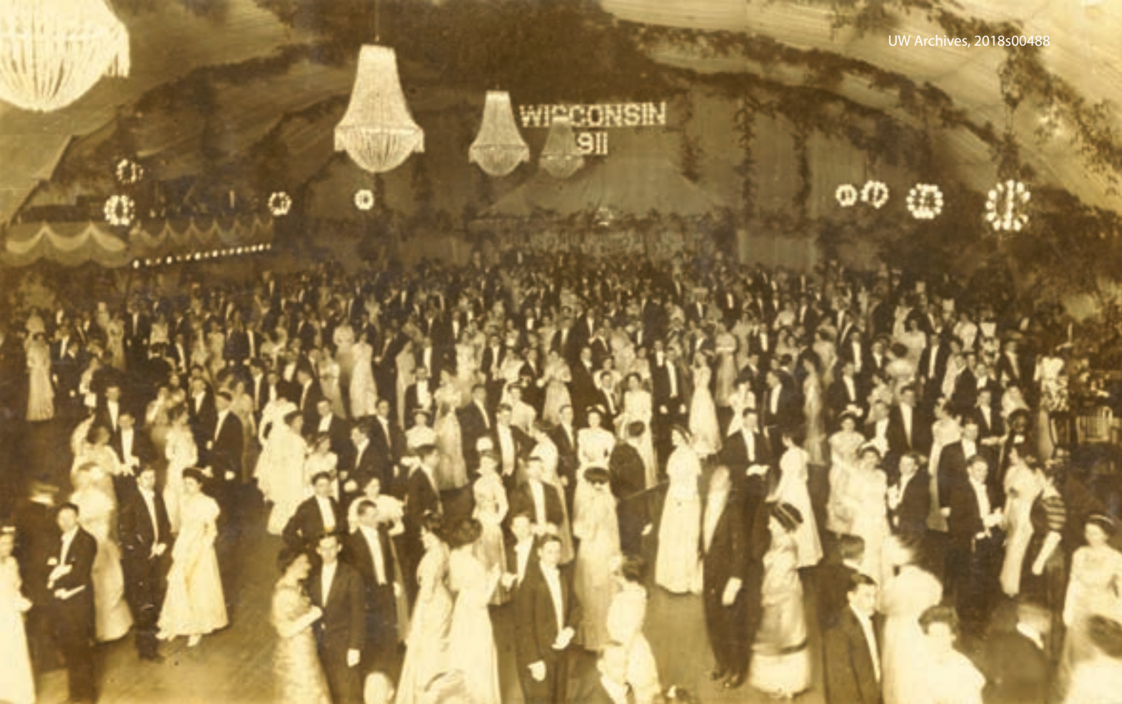
The first Attic Angel Association charity ball was held in 1898 in the University Armory, known today as the UW's Red Gym. It brought in almost $500 to benefit the poor – the equivalent of $15,000 in today's dollars. The formal dance photo from UW's Prom in 1911 shows what the inside might have looked like.